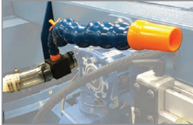
Individual valves regulate vapor delivery flow