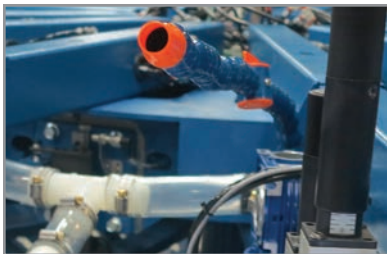
Adjustable delivery arms offer precise positioning