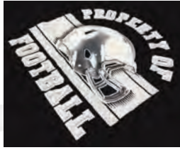
Screen Printed Underbase