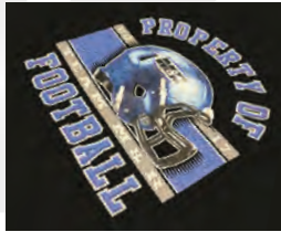
Digital Printed Colors