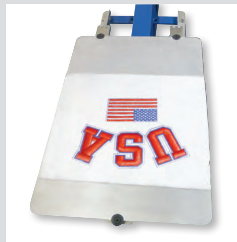
Link Pallet locked into Mobile Pallet Base and ready for printing