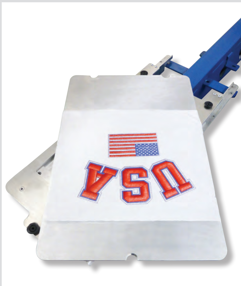
Link Pallet positioned to show part of underlying Mobile Pallet Base